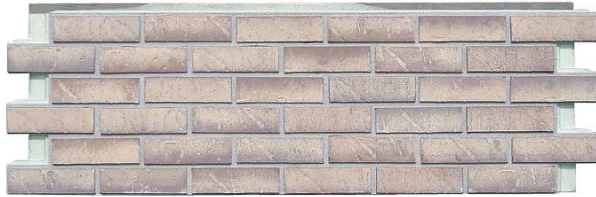
Earthtone Sands Heritage