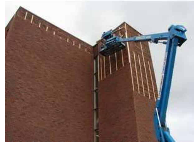
Extendicare, Sudbury, Ontario. Canada

Get the quality and benefits of real brick, but with the extras that only Pan-Brick can offer!